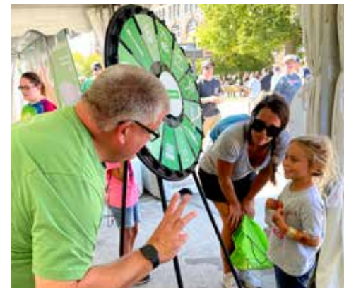
Fair-goers were able to spin the 'Spin & Grin' wheel to learn about healthy activities and win prizes at the 2021 Iowa State Fair.