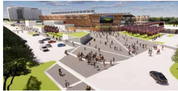
Delta Dental provided $50,000 for the development of the Pro Iowa Stadium and Global Plaza in downtown Des Moines.