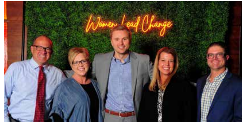
Members of the Delta Dental team attended the 2021 Women Lead Change Central Iowa Conference to support the advancement of women in the workforce.