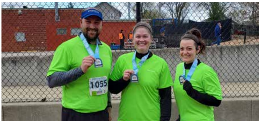
Delta Dental shared our #SmilePower by taking part in the 2021 Drake Relays Road Races and winning the medium size company Relays Wellness Challenge.