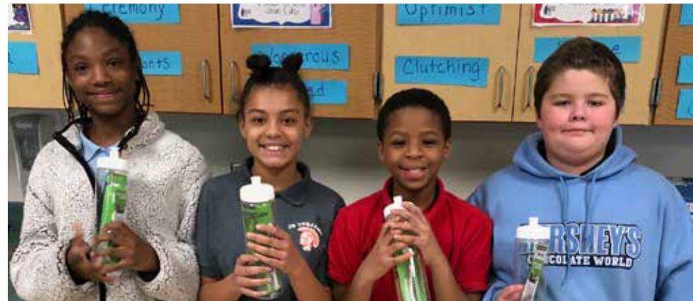
Dr. Walter Cunningham School for Excellence